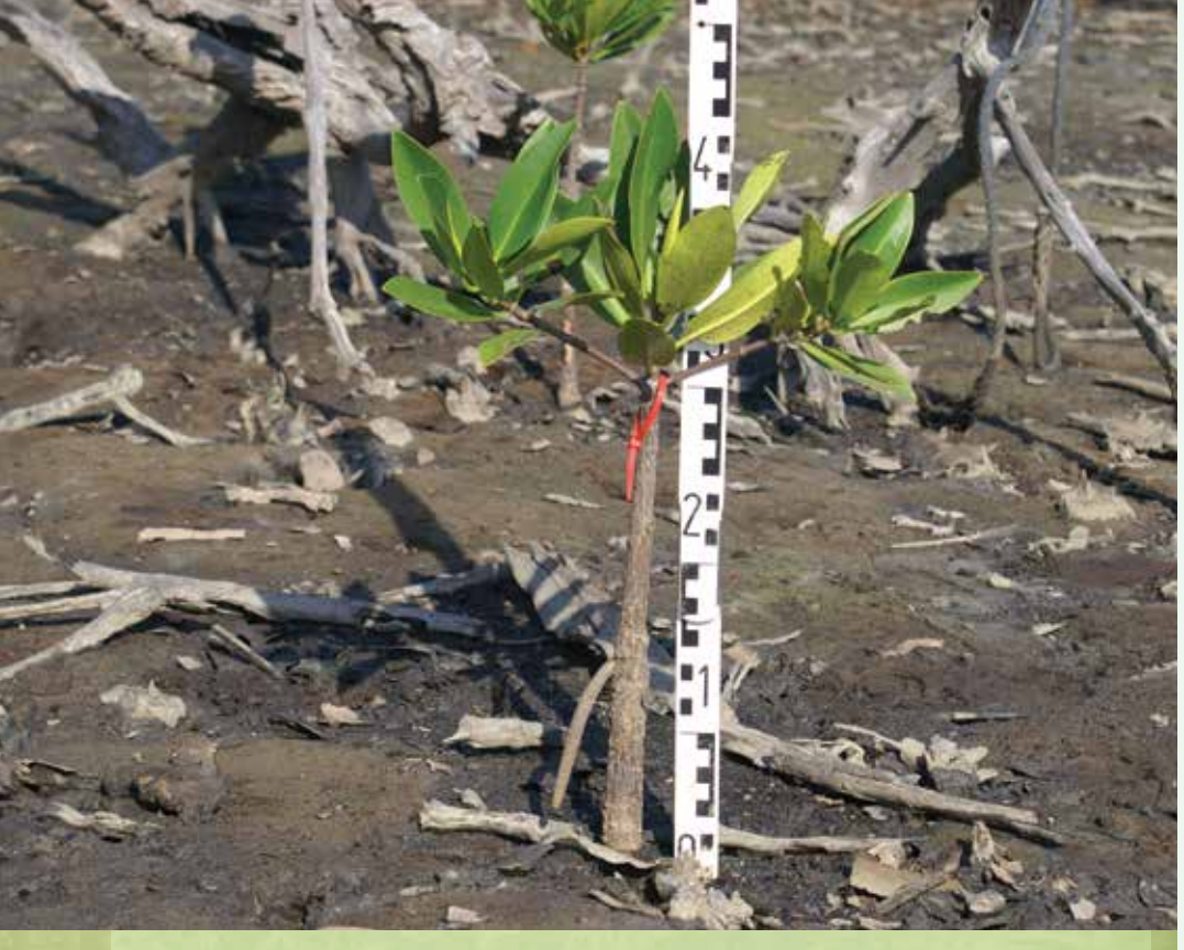
FIGURE 2. Rhizophora mangle seedling encountered along the transect in 2009 in El Pelican. Ground cover and growth height of species are recorded by every visit.

This natural laboratory should provide a deeper understanding of a range of successional pathways among mangrove populations